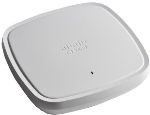
Figure 1. Cisco Catalyst 9115AX Series

The Cisco® Catalyst® 9115AX Series with Wi-Fi 6 is the next generation of enterprise access points. They are resilient, secure, and intelligent.