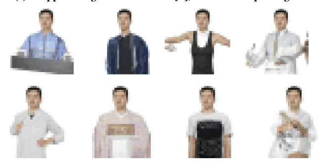
(b) 8 random autoregressive completions of the cropped images. 6 depict career-related attire.

(a) Cropped image of an artificial [1], white- male-passing face.